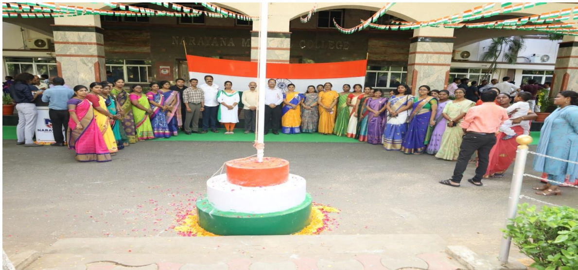
All the faculty gathered for flag hoisting

impactful celebration for all involved. Sweets were distributed to all participants, and the program concluded with the national anthem.